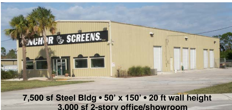
7,500 sf Steel Bldg • 50' x 150' • 20 ft wall height 3,000 sf 2-story office/showroom