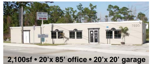
2,100sf • 20'x 85' office • 20'x 20' garage